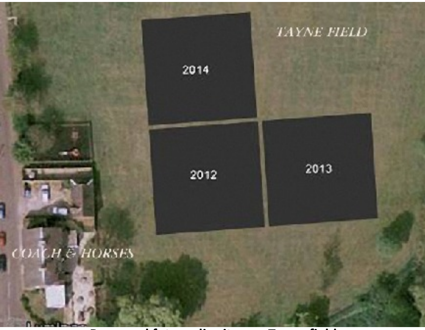
Proposed future dig sites on Tayne field